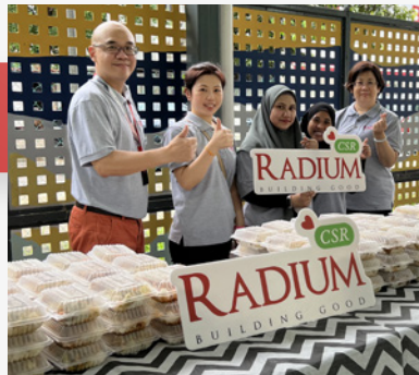
○ PERTIWI SOUP KITCHEN PROJECT