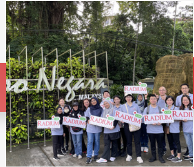
○ CSR PROGRAMME WITH ZOO NEGARA MALAYSIA