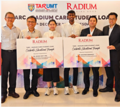
○ TARC-RADIUM CARE STUDENT LOAN