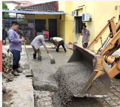
○ SHELTER HOME FOR CHILDREN