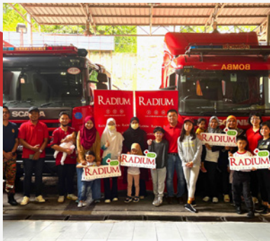
○ SAFETY TALK EVENT BY BOMBA MALAYSIA