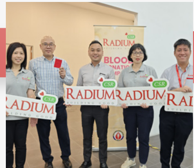
○ BLOOD DONATION CAMPAIGN