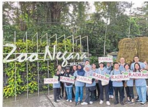
Radium supplied Zoo Negara with 99 specially designed umbrellas in conjunction with the zoo's 60th anniversary last year, while employees of the developer volunteered to spruce up facilities and animal enclosures at the premises.

to prepare freshly cooked food and goody bags for the homeless community in Kuala Lumpur. About 300 individuals received warm meals as well as reusable woven bags, each containing mineral water, and other sustenance like buns and boxed drinks.