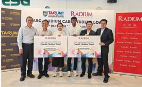
Radium has pledged RM500,000 to the TARC-Radium Care Student Loan scheme in recognition of the importance of education in empowering future generations.