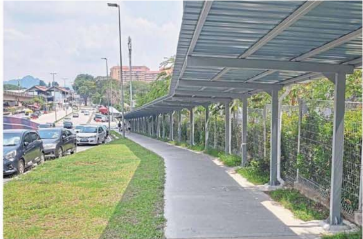
Radium is building a new solar-powered covered walkway to enable easy access to the Taman Melati LRT station and TAR UMT campus.

Radium also donated RM2,050 to the Pertiwi Soup Kitchen in an effort to address the needs of vulnerable individuals and foster a culture of compassion and support. The funds were used to purchase ingredients