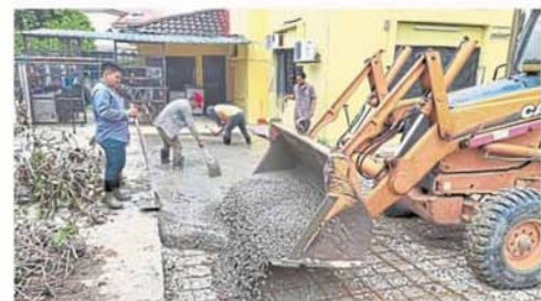
Radium contributed their expertise to enhance living conditions of the residents of the Shelter Home for Children, a non-profit organisation.

Additionally, Radium embarked on a CSR initiative with Zoo Negara. In lending support to conserve Malaysian treasures (the animals), Radium supplied the zoo with 99 specially designed umbrellas in conjunction with its 60th anniversary last year. Concurrently, its employees took part in the zoo's 'Groom' CSR programme, which saw Radium volunteers sprucing up facilities and animal enclosures at the premises. Radium then treated its employees and their family members with entry tickets to spend a day at the zoo, fostering a love of nature with their